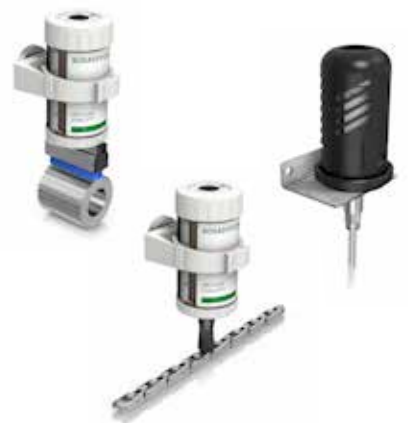
A wide range of accessories is available (selection)