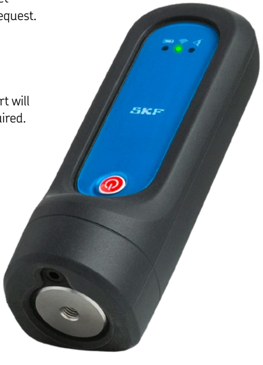
Part #: CMDT390-K-SL

Each SKF Pulse sensor comes with a calibration certificate. Calibration is good for two years. Sensors can be recalibrated by SKF Technical Services Group for a fee. www.skf.com/cm/tsg