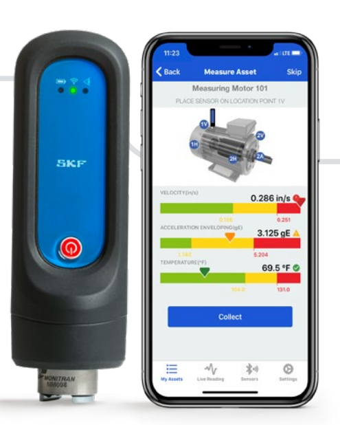
Part #: CMDT390-K-SL

The app allows you to "Edit My Asset" (Go to "My Assets," select the asset in need of correction, then select "Edit Asset" and change as needed.)