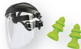
Industrial & Safety