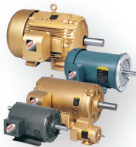
Motors & Drives