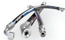
Hydraulic & Pneumatic