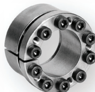
Retaining & Locking Devices