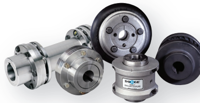
Mechanical Power Transmission