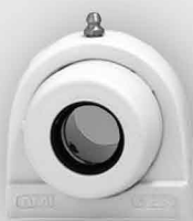
Tapped Base Pillow Blocks