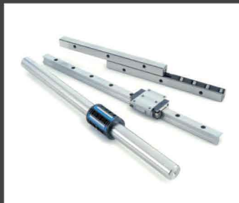
Stainless Linear Assemblies