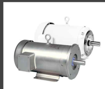
Stainless & Washdown Motors