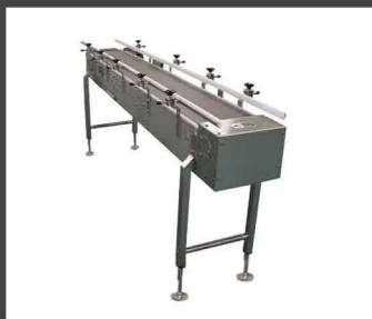
Conveyors & Components