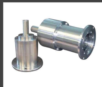
Stainless Planetary Reducers