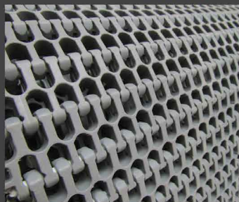
Plastic Modular Belting