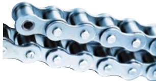
Sprockets & Chains