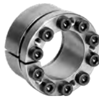
Retaining & Locking Devices