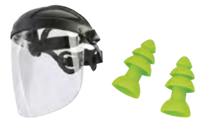
Industrial & Safety