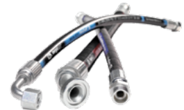
Hydraulic & Pneumatic