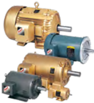
Motors & Drives