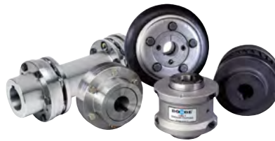
Mechanical Power Transmission